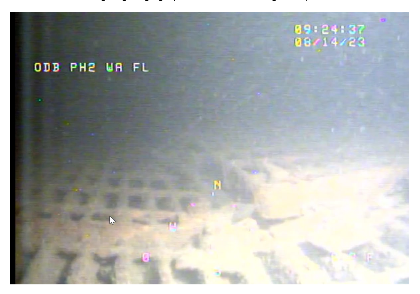
Figure 4. Raised corner grating.

The following images highlight portions of interest during this inspection: