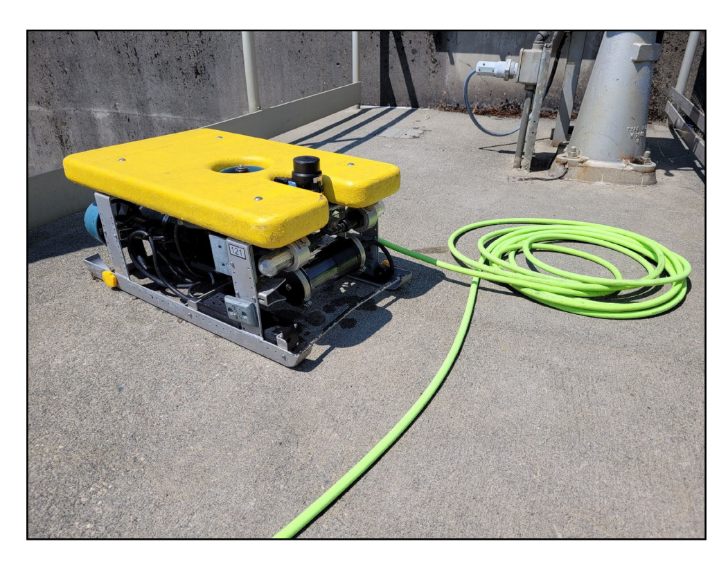
Figure 1 Outland 1000 ROV system.

The Bonneville Dam Fish Ladder inspection was conducted utilizing an Outland Technologies 1000 remotely operated vehicle (ROV). Visual inspection was conducted using the installed high-resolution camera and documenting video on HDD. Sonar imaging was conducted utilizing a Tritech Micron Sector/ Polar Scanning sonar.