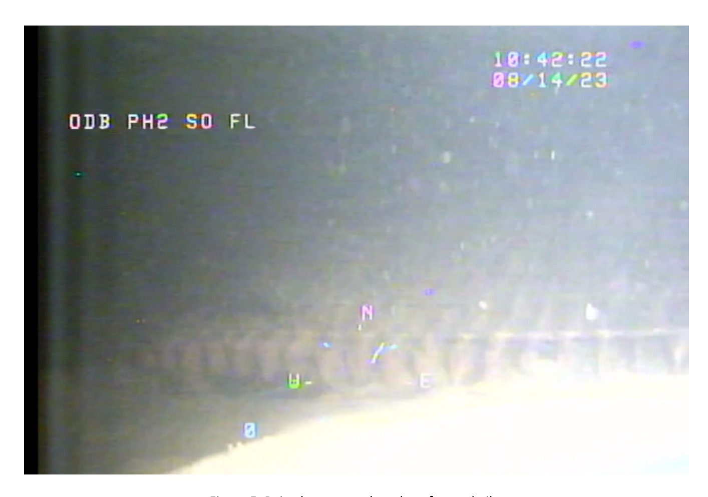
Figure 5. Raised corner at the edge of a sand pile.