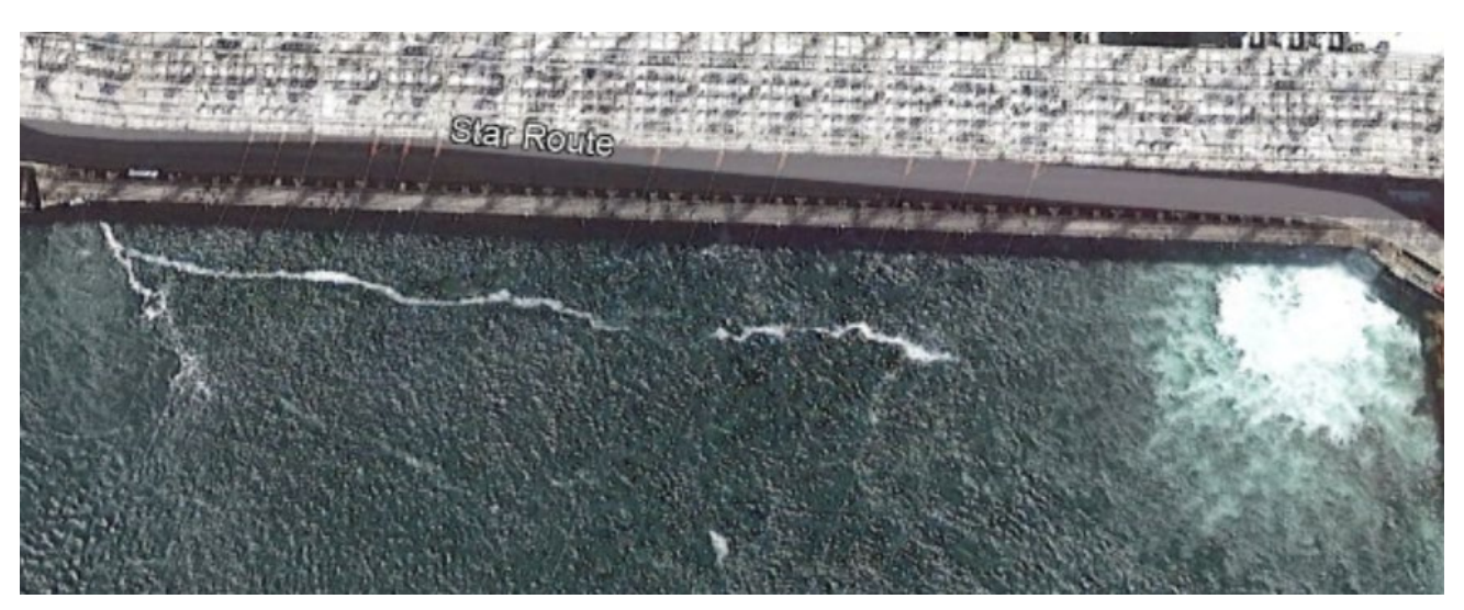
Figure 3 Bonneville Dam PH1. Location of inspection area on downstream side of the structure.